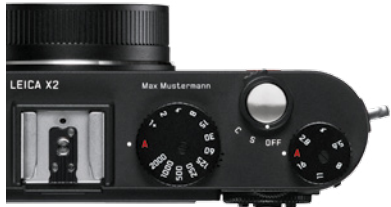
Top cover: single line of custom engraving.