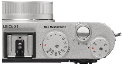
Top cover: single line of custom engraving.