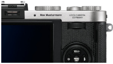
Rear cover: single line of custom engraving.