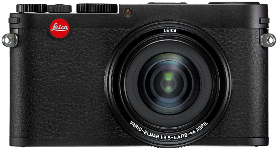
Full-size view, black anodized finish.