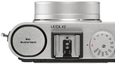
Flash cover: multiline custom engraving or small symbol.