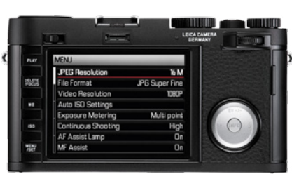
Leica X Vario