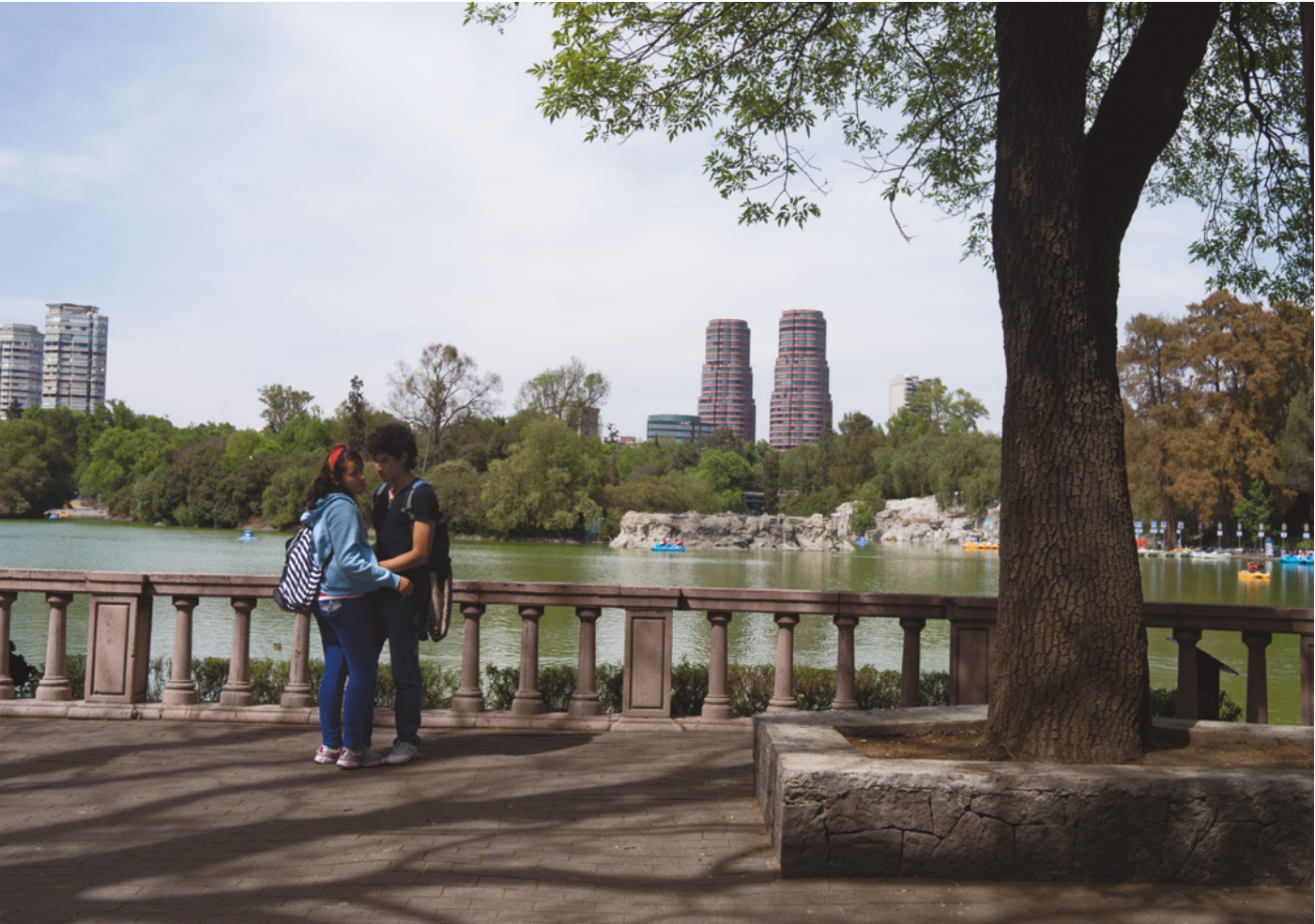
Chapultepec is a fascinating place. It's a place to fall in love with and a place for those in love. The sweetness of kisses is so much sweeter when they occur in such a wonderful setting.