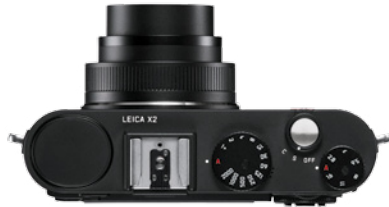
Leica X2, black anodized.