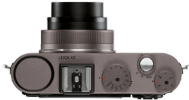
Leica X2, titanium anodized.