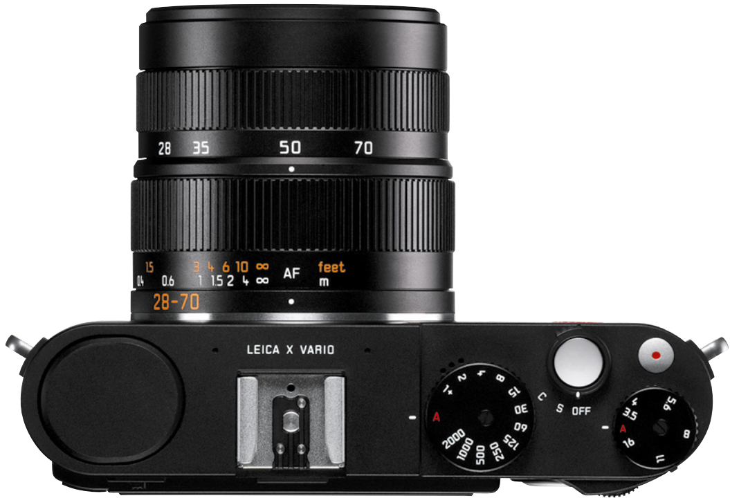
Full-size view, black anodized finish.