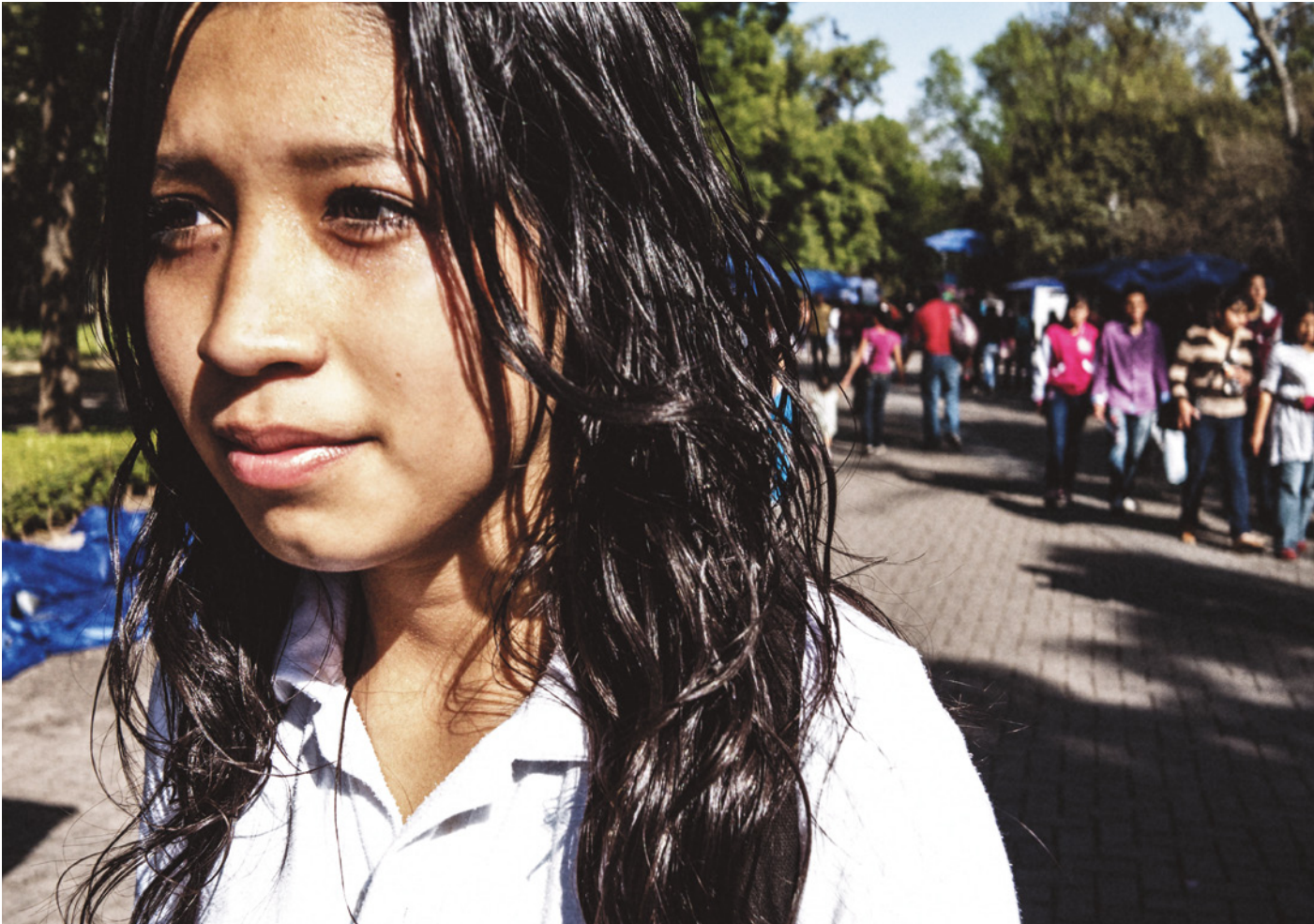
Completely oblivious to the world, this girl drifts through the park, her gaze turned inwards, totally unaware of the hustle and bustle around her.

The Leica X2 design also expresses its commitment to the essentials: compactness and finish. Reminiscent of the traditional M-Design, using the X2 becomes an instant love affair – not only due to its captivating looks, but also its wonderful feel in your hands. Once held, even for a moment, it becomes difficult to put it down. The weight of its robustly engineered full-metal chassis imparts an ideal impression of solidity while its leather-style finish is comfortable to the touch and allows for the perfect grip. The superior finishing of its premium materials makes the Leica X2 a true pleasure to hold, but its ultimate qualities are revealed when shooting.