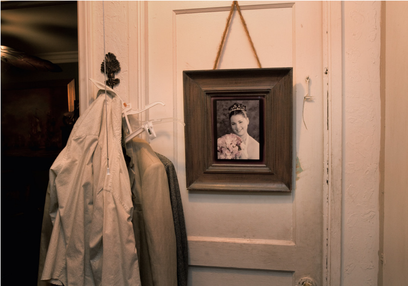
In a small dressing room, an old "quinceañera" photo recalls memories of the times when black and white photographs were colored by hand.

The Leica X Vario also lets photographers capture the little stories that life tells in motion pictures. That's because this compact camera offers a full-HD video recording option with 1920×1080 pixels and 30 full frames per second. Video capture can be started and stopped simply by pressing a single button on the camera's top plate. Particularly practical: the full-HD videos can be saved in Internet-friendly MP4 format and uploaded directly to social media or mobile devices, for example, without any need for conversion. This means that inspiring moments can now be shared with friends in HD videos. An integrated wind-cut filter ensures outstanding audio clarity. The Leica X Vario – the perfect camera for people on the go.