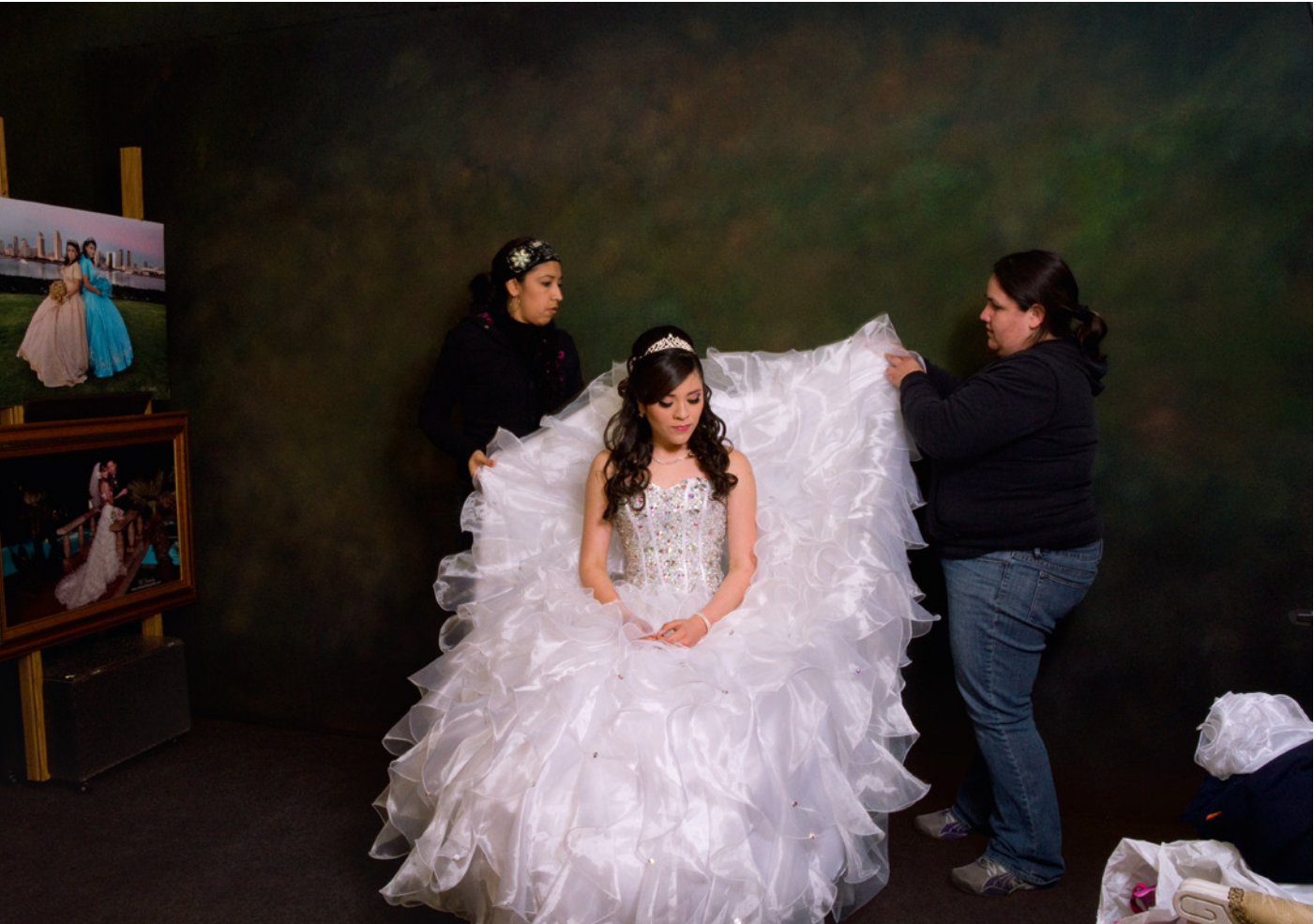
Appearances can be deceptive: it may look like the preparations for a wedding photo, but it is actually for the girl's "quinceañera" – a traditional Mexican celebration of the 15th birthday marking the transition from childhood to young womanhood.