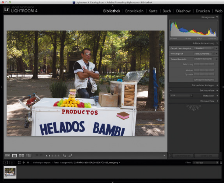
Leica X customers can download the digital workflow solution Adobe® Photoshop® Lightroom® 4 free of charge.

A powerful and user-friendly software package from Adobe® is provided with every X camera. All Leica X photographers can download Adobe® Photoshop® Lightroom®, the professional workflow solution for still picture and video processing, free of charge for Apple Mac® OS X or Microsoft Windows®. This complete solution for modern digital photography offers a wide range of options for creative image manipulation. All imaging parameters like white balance, exposure, sharpness, color balance, and saturation can be refined in post-processing until the desired results are achieved. The software also offers a wide range of functions for the management and exporting of digital images. Thanks to video processing options that go far beyond simple archiving and viewing functions, the software now enables video editing and the extraction of stills from video recordings.