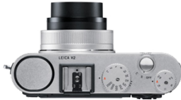
Leica X2, silver anodized.

Leica stands for uncompromising quality, made in Germany. The Leica X à la carte program is the logical extension of this homage to the finest quality workmanship. For instance, the Leica X2 is the only digital compact camera that can be personalized with an extensive range of premium real-leather trim options. The Leica X à la carte program is exclusive in offering a titanium anodized finish in addition to the standard silver and black options. The addition of personalized engraving on the aluminum top plate makes your Leica X2 truly unique. The selected components are assembled by hand in the Leica factory with painstaking attention to detail to create a truly personal and unmistakable Leica X2. As you would expect the Leica X à la carte program also includes camera protectors and straps in matching colors using the same premium materials employed for the camera’s leather trim. Leica X2 – Made for individualists and perfectionists.