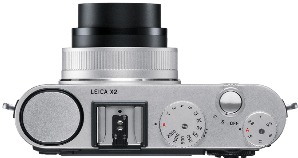
Full-size view, the camera is available in a silver or black anodized finish.

In every single detail, the Leica X2 is focused on the essentials. And thanks to exactly this discipline, it can offer the photographer an enormous array of choices for authentically and spontaneously recording life as it happens. Its automatic functions are limited to the most relevant ones; its flexible and versatile manual controls invite you to experience photography in its purest form. The result: images that, thanks to the camera’s discrete and compact form, capture the very essence of the world around you. The new Leica X2 is far more than a camera. It is the joy of photography.