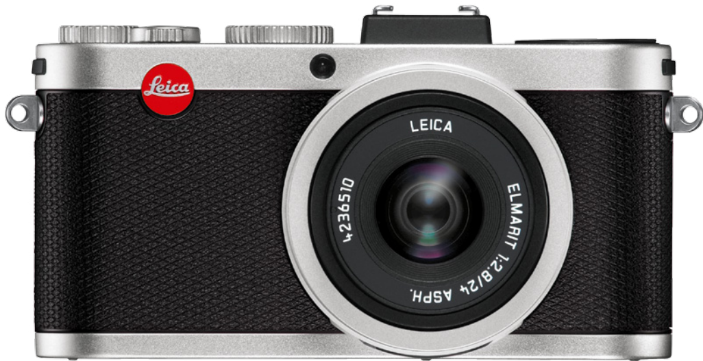
Full-size view, the camera is available in a silver or black anodized finish.