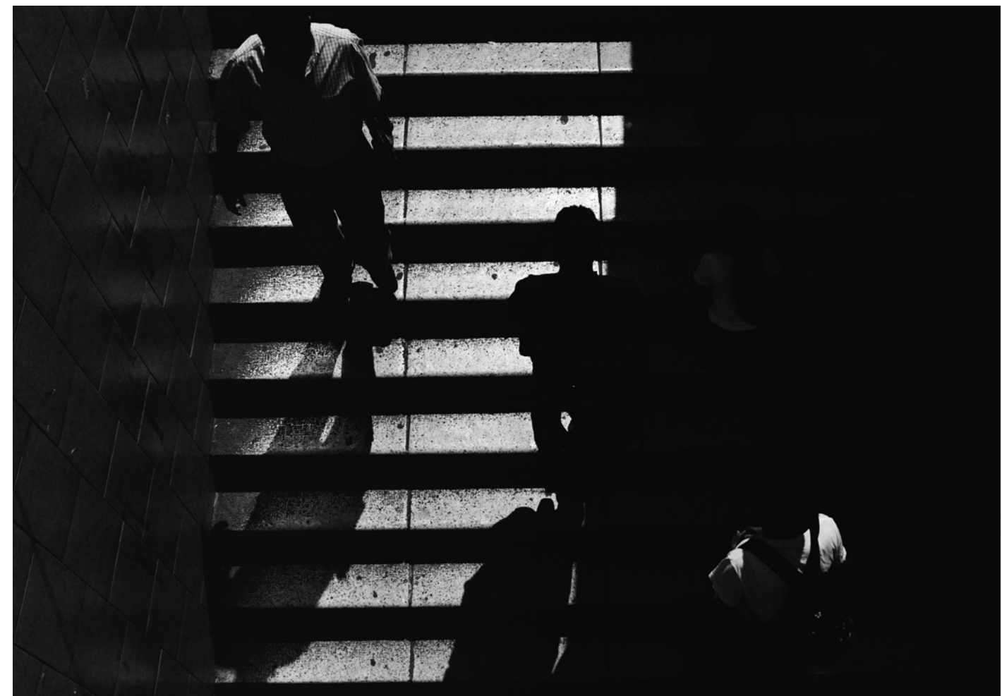
Top: A character seemingly from a bygone age transports his immensely popular wares: ice cubes. His demeanor tells us he’s probably been doing this all his life. Bottom: The entrance of an underpass that opens into the park. The entrance to a world in which the borders of reality and dreams sometimes seem to waver and blur.