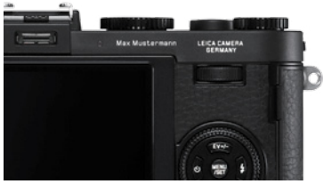
Rear cover: single line of custom engraving.