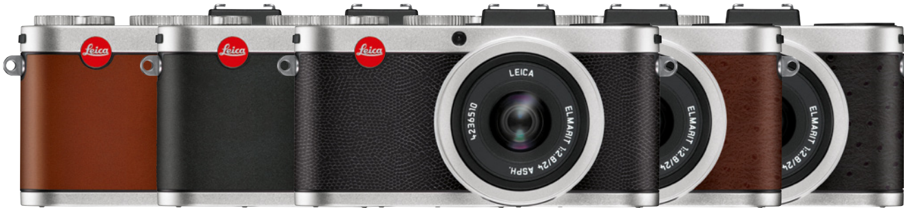
Organically-tanned, cognac. Saddle leather, black. Lizard-look, black. Ostrich-look, chestnut. Ostrich-look, black.