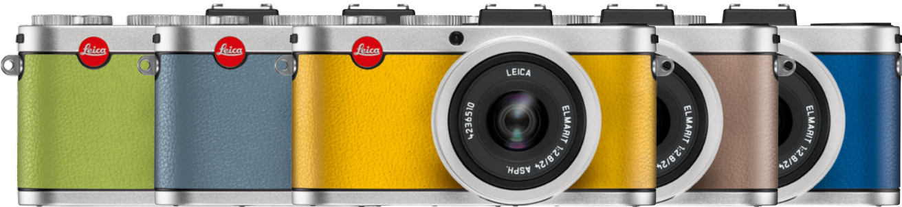
Full-grain cowhide, apple green. Full-grain cowhide, dove blue. Full-grain cowhide, lemon yellow. Full-grain cowhide, Aztec beige. Full-grain cowhide, Capri blue.