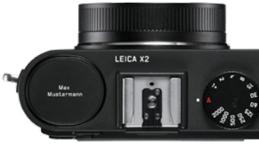
Flash cover: multiline custom engraving or small symbol.